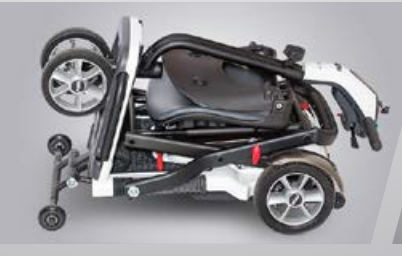
Unique folding design for fast, convenient storage or transport.