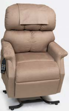
Comforter Jr. Petite PR-505JP