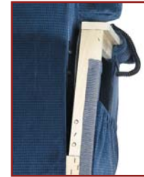
501 M shown