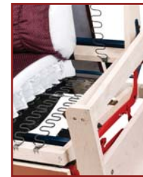
508 M shown

Each luxury lift & recline chair is hand crafted in our facility using decades of motion furniture experience.