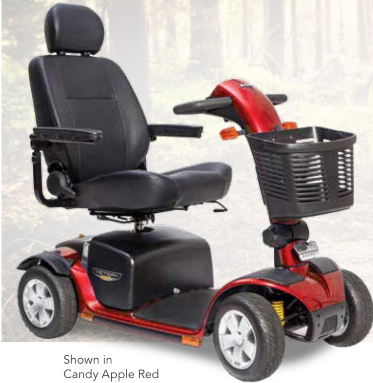
Shown in Candy Apple Red