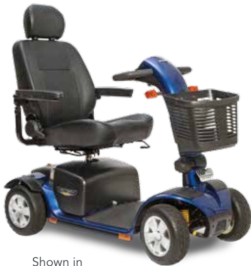
Shown in Viper Blue

The Victory ® Sport incorporates a sporty design with extra comfort and performance features for a truly unique ride experience. With a maximum speed of 8 mph—the fastest within the Victory Series—this scooter will accelerate your active lifestyle. Standard features include feather touch disassembly, wraparound delta tiller, 10" solid tires, front and rear suspension, high-back reclining seat, directional signals, a high-intensity LED lighting package, backlit battery gauge and a front basket. Available in Viper Blue and Candy Apple Red.