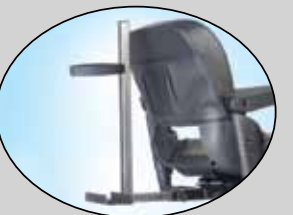
Quad Cane Holder