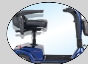
Power Elevating Seat