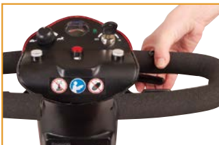
EZ Reach tiller adjustment