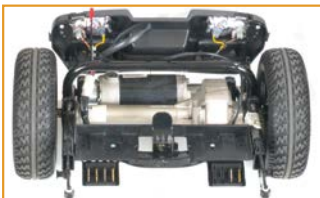
Quiet & maintenance-free motor