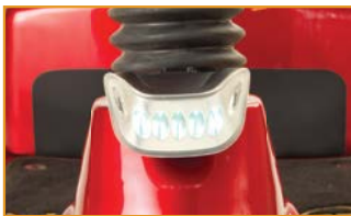
Angle adjustable LED headlight creates a wide path of bright light