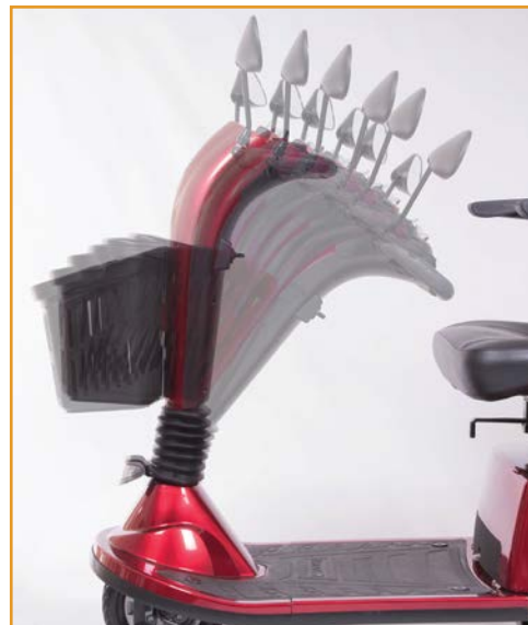
Patented infinite adjustable tiller