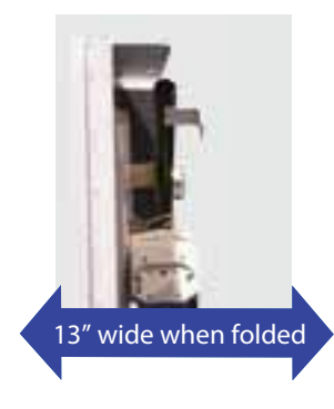
Free-standing post kit eliminates need for any wall mounting.