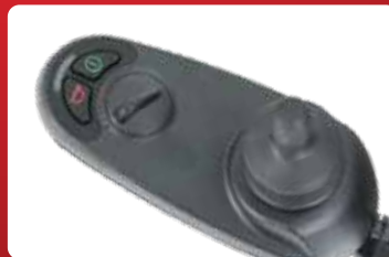
PG GC3 controller

The Jazzy Select® 6 1 incorporates sporty design and performance features for a truly unique ride experience. Pride's patented Active-Trac® Suspension combined with six wheels on the ground and an innovative articulating beam allow for superior performance indoors and out, with added stability over uneven terrain and ramp transitions.