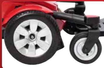
Active-Trac® Suspension with Mid-wheel 6® Technology