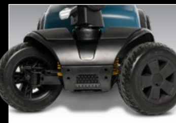
Patented EZ Turn technology provides unrivaled tight turning.