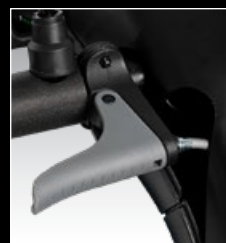
Easy one-handed tiller adjustment